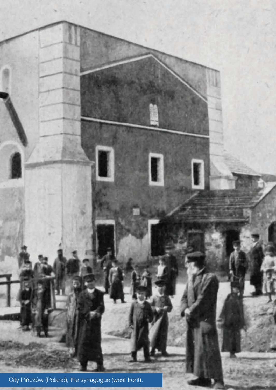
City Pińczów (Poland), the synagogue (west front).