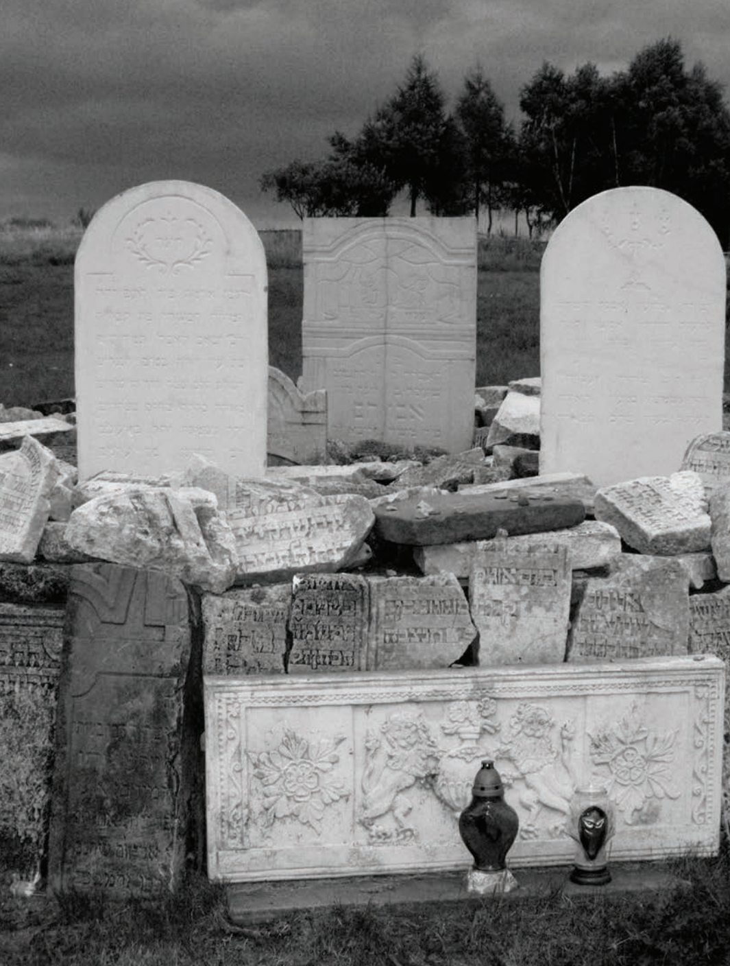
Memorial from broken gravestones in the ancient Jewish cemetery in Chmielnik in memory of the Jews killed by the Nazis during the Second World War.