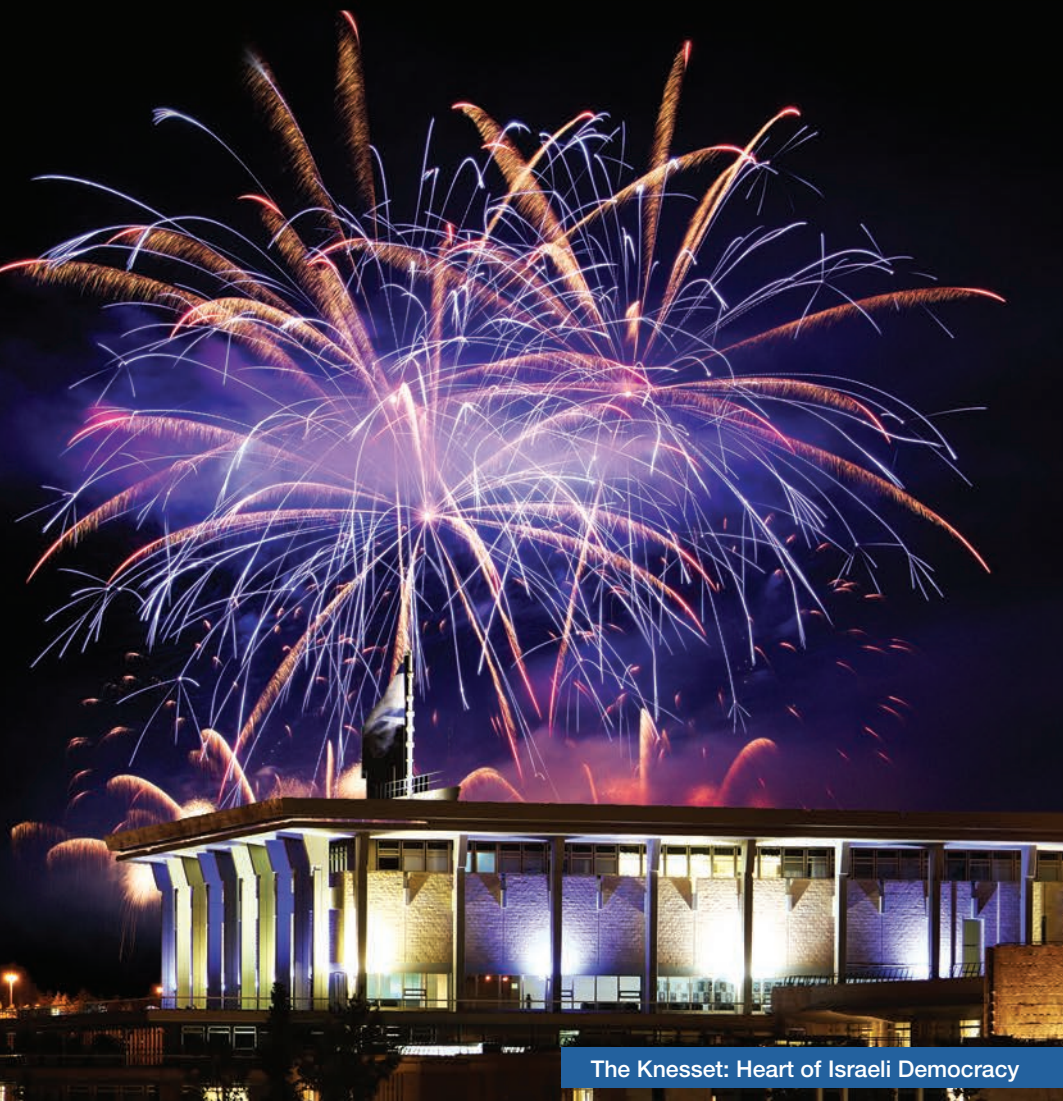
The Knesset: Heart of Israeli Democracy