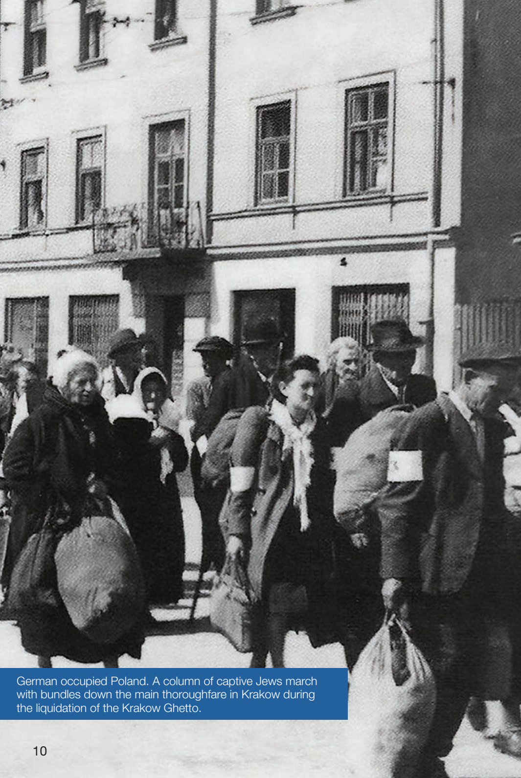
German occupied Poland. A column of captive Jews march with bundles down the main thoroughfare in Krakow during the liquidation of the Krakow Ghetto.